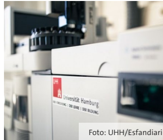
Clean Room at ChyN